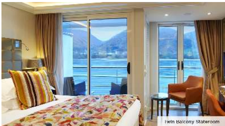
Twin Balcony Stateroom

7-night cruise | December 4-11, 2023 | Aboard AmaSerena